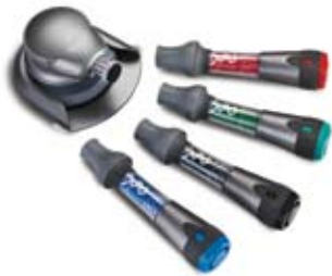
mimio® Capture kit digitally records dry-erase marker