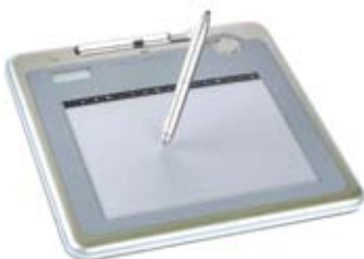
mimio® Pad lets you control your system throughout the room