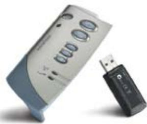
mimio® Wireless module and USB receiver