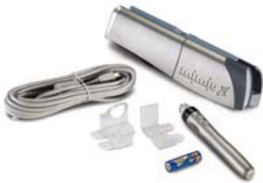
mimio® Interactive bar, mimio® mouse, USB cable (16' / 5 m), battery for mimio® mouse, mounting brackets